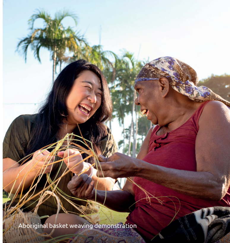
Aboriginal basket weaving demonstration