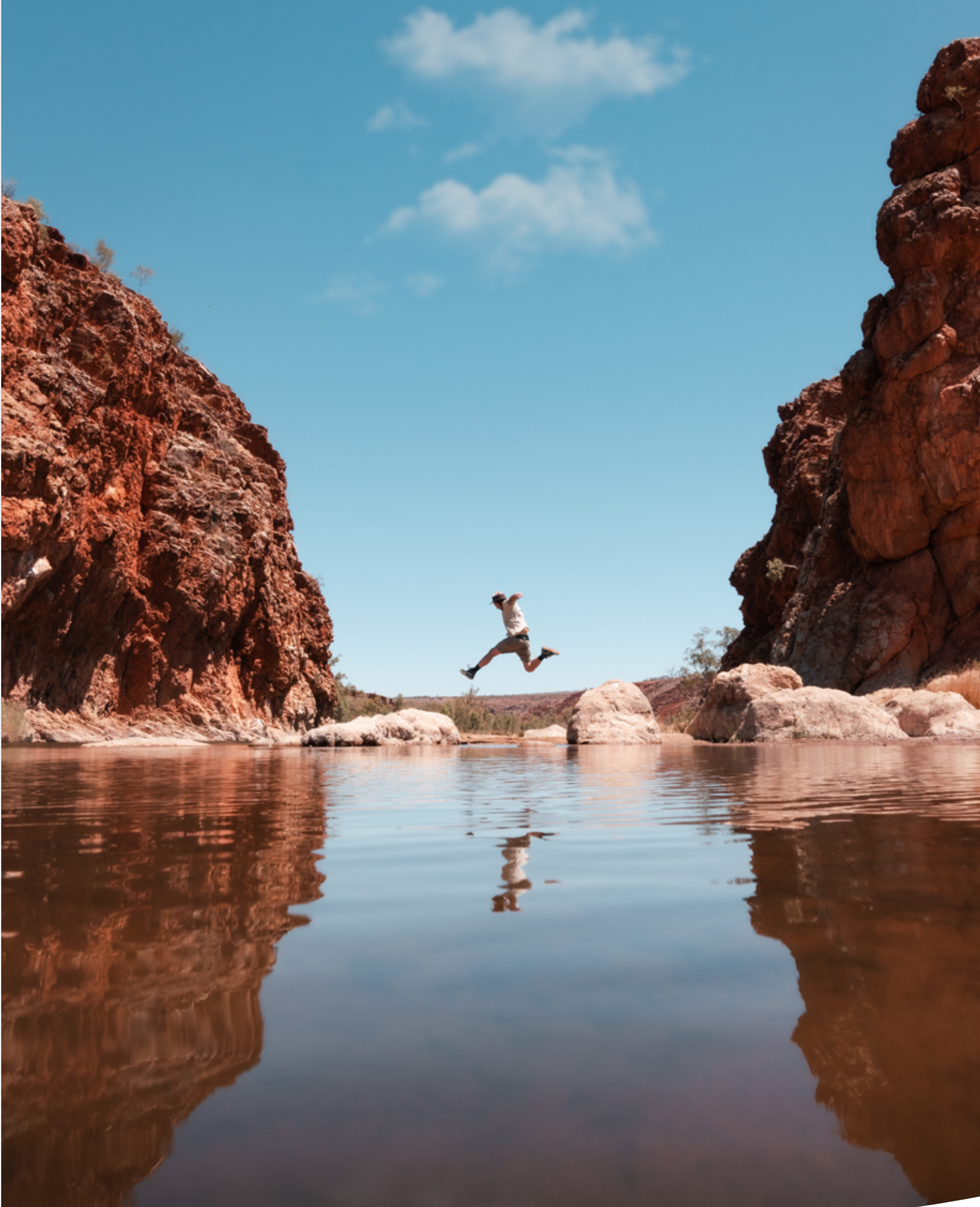
Jumping over rocks at Glen Helen