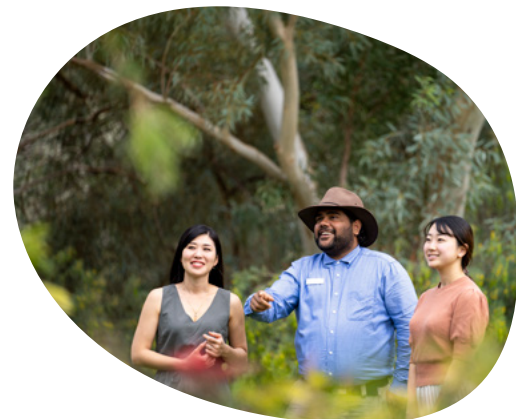
Top image: Nourlangie Rock Art Kakadu