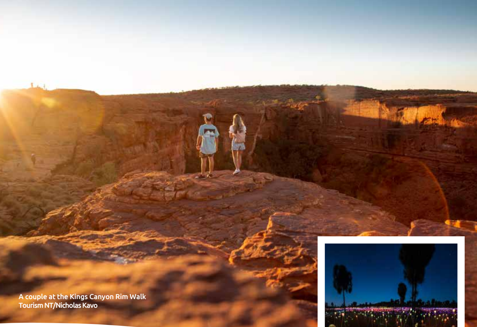
A couple at the Kings Canyon Rim Walk