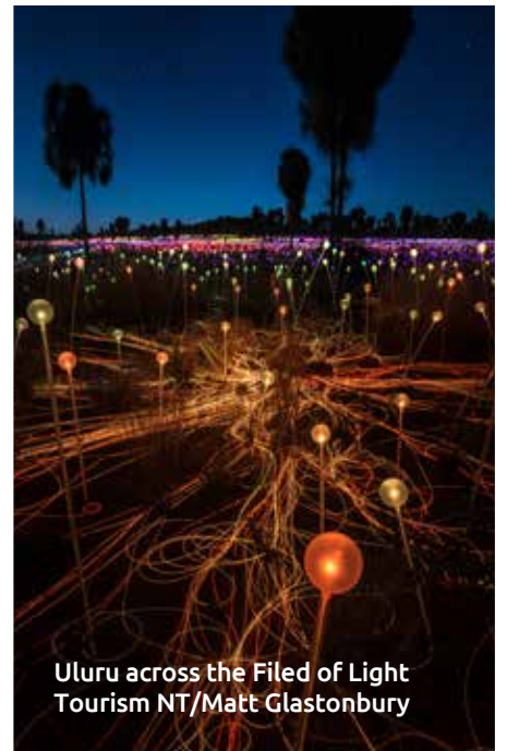
Uluru across the Filed of Light

Continue on the road to Kata Tjuta and find out just how ancient and imposing