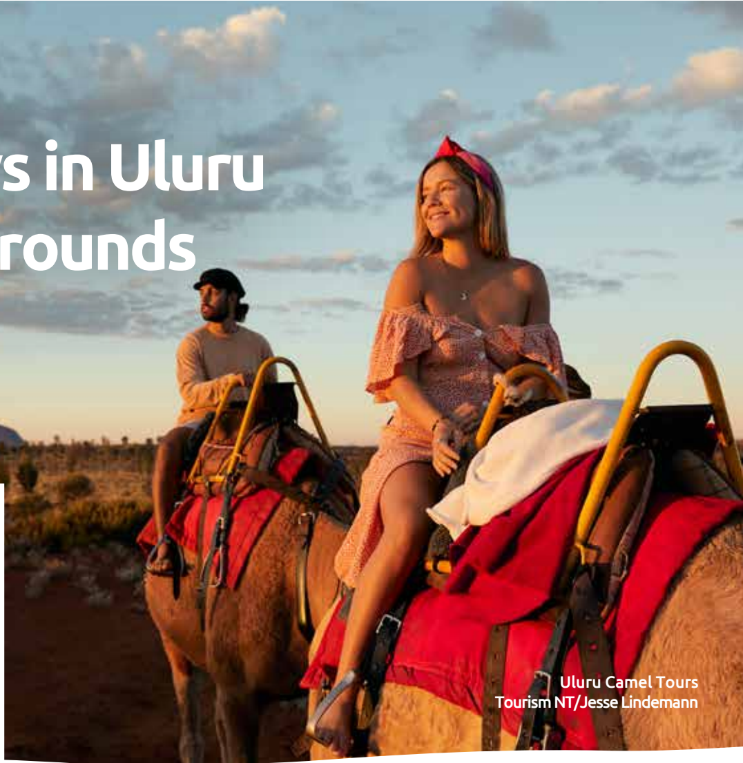
Uluru Camel Tours