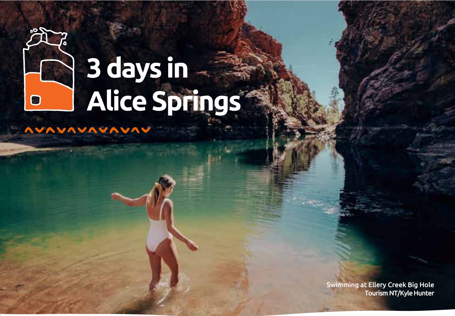
Swimming at Ellery Creek Big Hole Tourism NT/Kyle Hunter

This three-day itinerary will introduce visitors to the vibrant and modern city set against the backdrop of the magnificent MacDonnell Ranges.