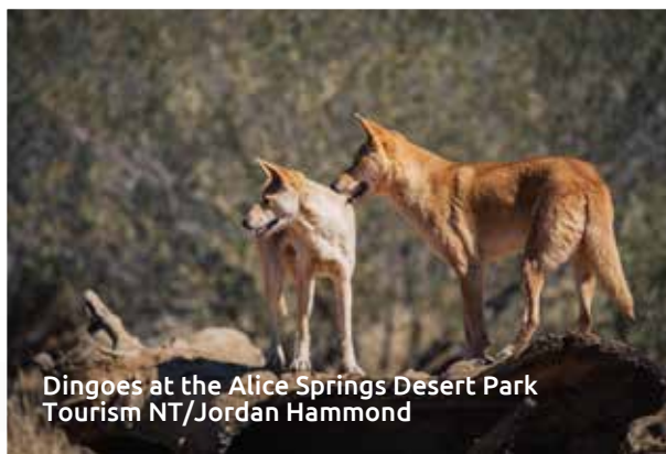
Dingoes at the Alice Springs Desert Park

ground again, it's time to indulge in a cooked breakfast at the Bean Tree Café which you can find nestled in the Olive Pink Botanic Garden .