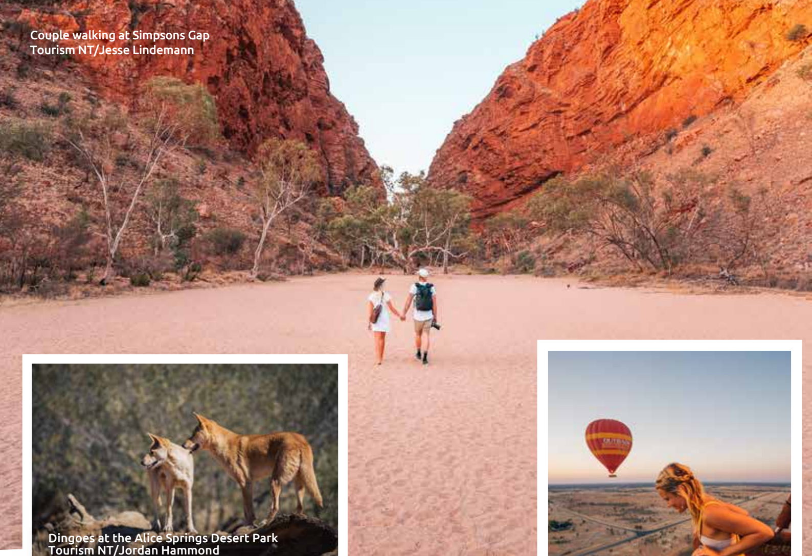
Couple walking at Simpsons Gap